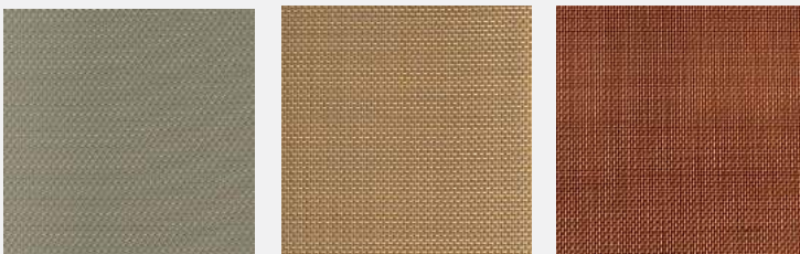
AL 260/55 with Low Iron Glass