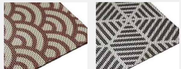
PR 260/50 Red Pattern